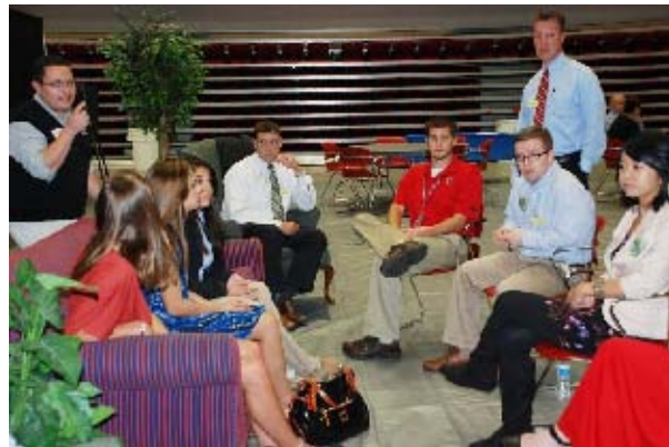
Hanging out with HYP: Hickory Young Professionals offer advice to seniors during Career Prep Conference in October.

To learn more about Hickory Young Professionals, visit their website at www.hickoryhyp.com .