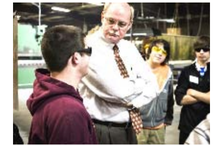
Concept Frames tells students how they use math and science in their industry.

Businesses that participated in the EXTREME STEM Tour 2012-2013 include Benco Steel, Catawba County EcoComplex, Catawba Valley Medical Center, Century Furniture, Charlotte Charter Jet,