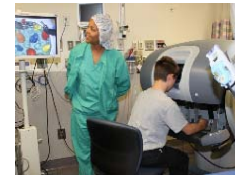
A Grandview student tests his skills as a surgeon while using the DaVinci Machine at Frye Regional Medical Center.

With months of planning and an "extreme" schedule, the EXTREME STEM Tour was created. The goal was for 8 th grade students to be more aware of local opportunities in STEM careers as well as the specific skills and training required. The students learned the importance of taking higher levels of math and science coursework while in high school to be prepared for postsecondary training or entry into a STEM career.