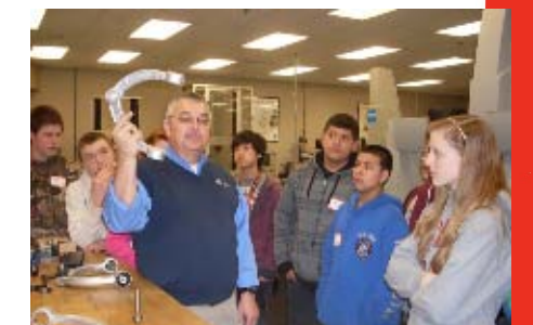
ZF Lemforder talks to students about the Quality Lab and the precision in advanced manufacturing.

City of Conover Wastewater Treatment Facility, City of Hickory Water Facility and Wastewater Treatment Facility, Commercial Fabricators, CommScope, Concept Frames, Corning Cable Systems, Deluxe Printing, Duke Energy, Ethan Allen, Flowers Baking Co. of Newton, Frye Regional Medical Center, General Dynamics, GKN Driveline, Graystone Eye, Hickory Business Furniture, Klingspor Abrasives, LEE Industries, Manufacturing Solutions Center, National Guard, NC Center for Engineering Technologies, Performance Food-IFH, Sarstedt, Shurtape Technologies, Turbocoating, Vanguard Furniture, von Drehle Corporation, Western Piedmont Council of Governments, and ZF Lemforder.