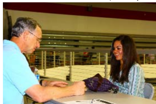
Education Matters business partners conduct a mock interview and portfolio reviews with high school seniors during the Career Prep Conference.

In addition, the students attended a "mini" college fair where they learned about local education and training opportunities from ASU, CVCC, CVCC Innovation Center, LRU, and NC CET.